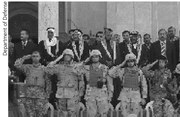
Iraqi sheiks stand and U.S. army soldiers salute as the Iraqi flag is raised at a power-transfer ceremony in Tikrit in 2004

origins of Islam, and, if they are lucky, the split between Sunnis and Shi’as. But beyond this, the region might as well fall off the map, for the next time many students will encounter Mesopotamia, it pops back up as a place called Iraq and in the context of the current conflict. In other words, there is a gap of more than a millennium. With this kind of disconnect, why should students care about history and how can we expect them to understand the thorny nature of the current situation?