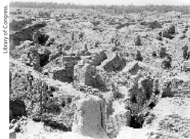
The ruins of the ancient city of Babylon (photo taken in 1932)

The most pressing issue facing our nation today is the conflict in Iraq. However, for most American youth, knowledge of Iraqi history is piecemeal at best. In an ancient history class, students will learn about Mesopotamia (“the land between two rivers”) as the first civilization; they might also study the ancient kingdoms of Assyria and Babylonia. They may learn about the